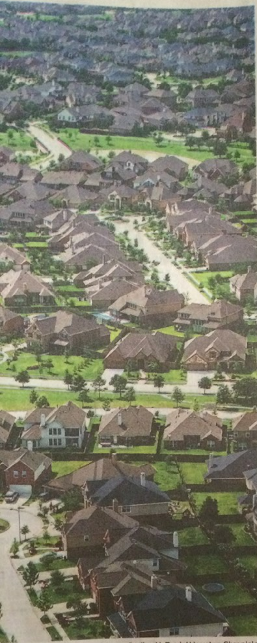
Smiley N. Pool / Houston Chronicle